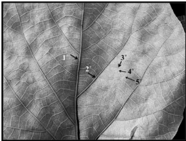
Fig. 2 : Five order venation patterns of leaf, 1 o : midrib, 2 o second vein, 3 o : third vein, 4 o : fourth vein, 5 o : fifth vein, in the Cordia myxa .