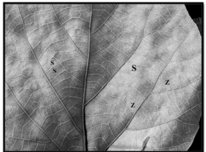
Fig. 4 : venation patterns of leaf appear the zone and segment in the Cordia myxa .

venation, which is the veinlets are not directly rolled up and some of their ends extend to intersect with the central vein and made space connected to it extending along the middle vein and sides (Fig. 3) and the third veins type are lattice and percurrent.