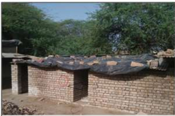
Figure - 1. The nesting site in the adobe wall at Marusthali colony, Jodhpur observed during February, 2018.

The six nests of Megachile gathela was found at Marusthali colony, Jodhpur, Rajasthan, India on 18 February, 2018. The nesting site was found in the adobe wall of house at about 26° 15' 46.9" N of Latitude and 73° 01' 43.3" E of Longitude.